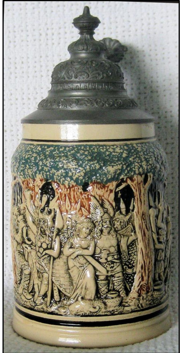
1/2L Stein, Horned and Winged Headdress.

Mediterranean by long boat, since Arabs, Greeks and Vikings (and Normans) coming by long boat, all inhabited Sicily and parts of Italy in various ancient times. Persian silver coins have been found in Viking graves in Scandinavia. What I do know is that English (and German) is classified as a Teutonic language and came from Old Norse. French and other languages were mixed in later.