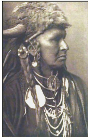
Sioux, White Man Runs Him, ca 1906

Further west the Plains Indians honorary headdresses were horned like the Vikings. Later Indian head-dresses had horns and feathers and gradually only feathers like we see today. So it's possible that the "Horned Helmet" came to Northern Europe from the American Indians, and might provide indirect evidence that Vikings in fact did meet American Indians.