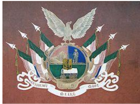
Fig 2 South African Republic

and cartridge belts on horseback with the motto above in Dutch Eendragt Maagt Magt (Unity makes strength). This is a fairly common motto in many languages, but in Dutch it also appears on the coat of arms of the South African Republic ( fig. 2 ).