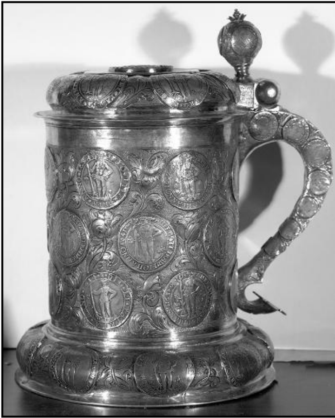
Hand-wrought silver tankard. Circa 1685, by silversmith Hans Georg Beltz, Berlin. 79.6 troy ounces; Height: 275 mm.

The piece appears to be solid coin silver, inset with 61 coins, mostly German secular thalers of the numismatically popular "Wild Man" type from Brunswick-Wolfenbittel and Brunswick-Luneburg. Between the coins, the field has something of a matte texture, and ornate reousse flowers and foliage rise through the fields. These are also chased to increase the quality of their detail.