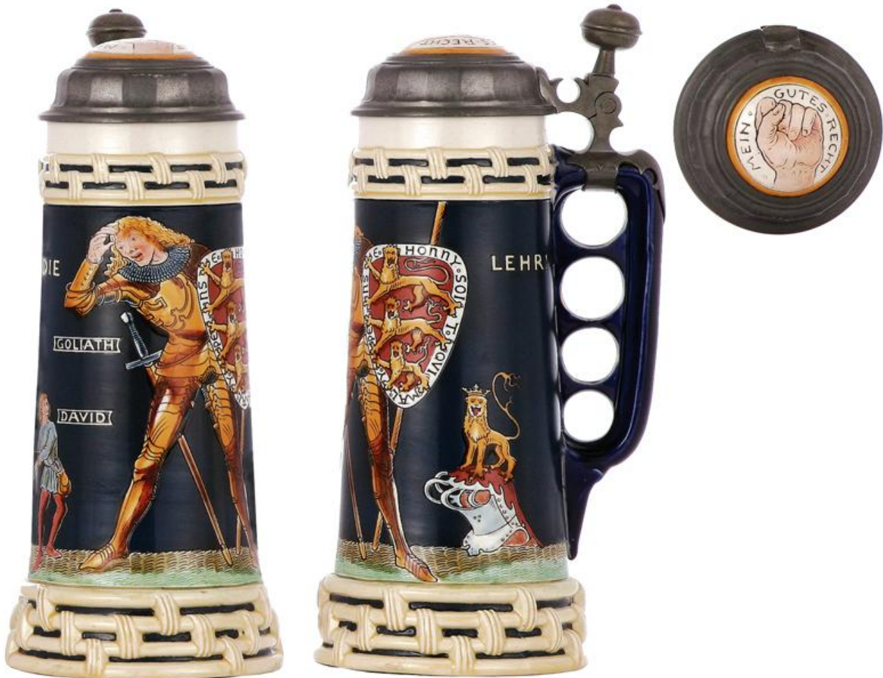
Fig 9 and Fig 10

However the appearance of the stein by 1901 didn't anticipate that the overwhelming size of the British forces allowed them to squelch the Boers in the second Boer War of 1899-1902 and the Boer republics became part of the British colonies. In 1915 German South West Africa was also taken by the British and the whole became the Union of South Africa. By the end of WWI in 1918 the remaining German colonies in North Africa were forfeited and the rest is history.